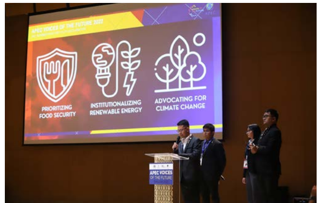
Group presentation on Food Security and Climate Change.