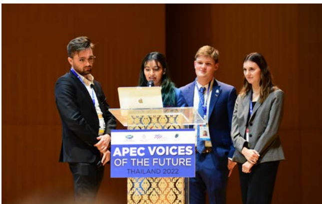
Group presentation on the theme: "Open to All Opportunities".