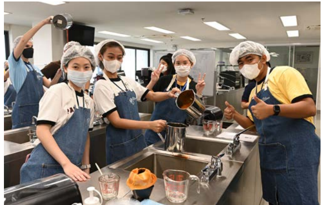
APEC Voices delegates learning the art of Thai traditional Thai milk tea.

After a long day of visits, the youth delegates found time to swim at the Royal Navy Senior Club. Dinner was a relaxing barbecue seafood treat.