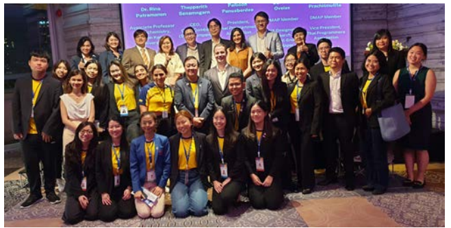
APEC Voices delegates with officials of Asia Foundation at the “Let’s Code Thailand” event.