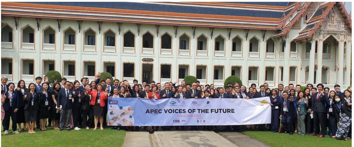
Officials, supporters and APEC Voices of the Future 2022 delegates at the Vajiravudh College.