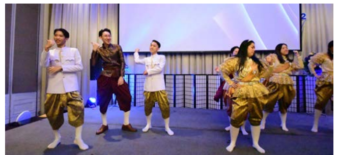
Cultural performances by APEC Voices 2022 Delegates from various economies at the closing ceremony.