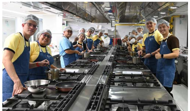
Learning the Thai cuisine at the PIM Culinary School.