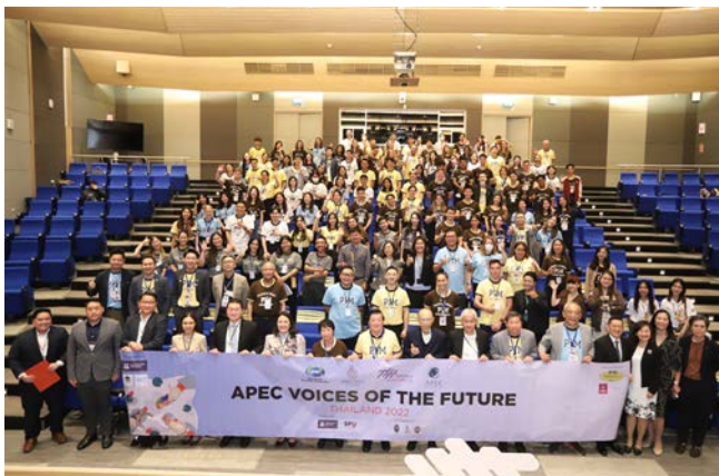
APEC Voices delegates with the Senior Officials and trainers of Panyapiwat Institute of Management (PIM).