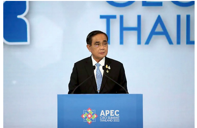
H.E. Prayut Chan-o-cha, Prime Minister of Thailand at the opening of the APEC CEO Summit 2022, Bangkok, Thailand.

Thailand was honoured to host the APEC Leaders' Week on 18 and 19 November 2022 in Bangkok. The event was attended by heads and representatives of the 21 APEC member economies: Australia, Brunei Darussalam, Canada, Chile, People's Republic of China, Hong Kong China, Indonesia, Japan, Republic of Korea, Malaysia, Mexico, New Zealand, Papua New Guinea, Peru, Philippines, Russia, Singapore, Chinese Taipei, United States of America, Vietnam and Thailand, the host.