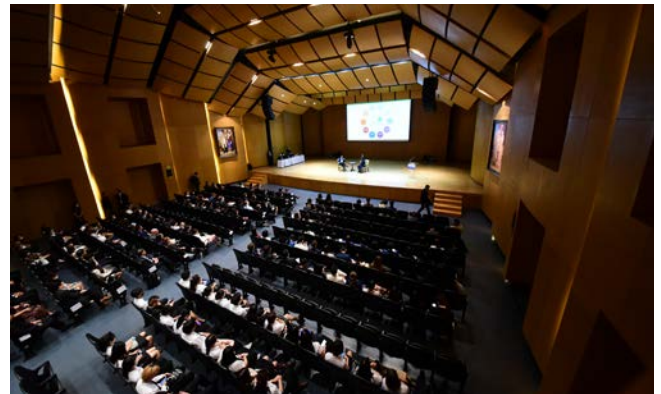
APEC Voices delegates and Thai youths attending the APEC Voices Youth Forum 2022 at the Vajiravudh College Auditorium.