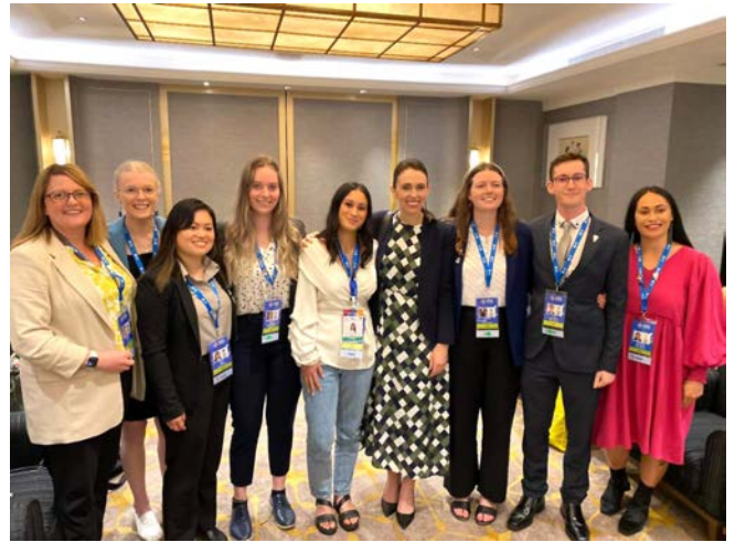
New Zealand's APEC Voices Delegates with H.E. Jacinda Ardern, Prime Minister of New Zealand at the fringe of the APEC CEO Summit 2022.