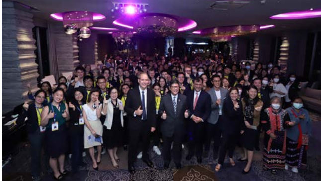
APEC Voices delegates attending the “Let’s Code Thailand” event at Westin Sukhumvit Hotel, Bangkok.