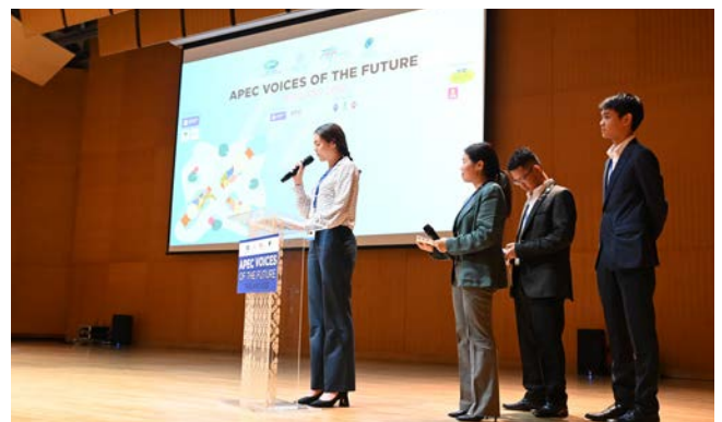
Group presentation on the theme: "Balance in All Aspects".