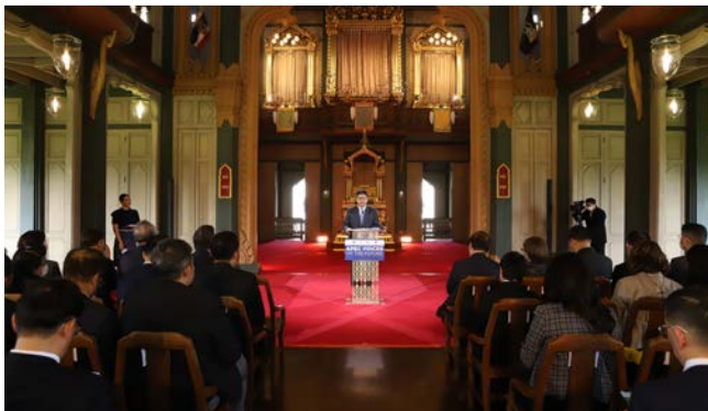
The Honourable Thani Thongphakdi, Permanent Secretary, Ministry of Foreign Affairs and SOM Chair 2022, Thailand.

H.E. Don Pramudwinai Deputy Prime Minister and Minister of Foreign Affairs, Thailand