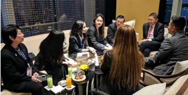
Singapore' APEC Voices Delegates meeting H.E. Dr Maliki Osman, Second Minister for Foreign Affairs and Second Minister for Education, Singapore.

The APEC Leaders' and Ministers' schedules in Bangkok were extremely tight during APEC Leaders' Week. The APEC Voices delegates briefly met with H.E. Jacinda Ardern, Prime Minister of New Zealand, at the fringe of the APEC CEO Summit. The APEC Voices Singapore delegates had an hour of engaging meeting with H.E. Dr Maliki Osman, Second Minister for Foreign Affairs and Second Minister for Education of Singapore, at the Novotel Hotel.