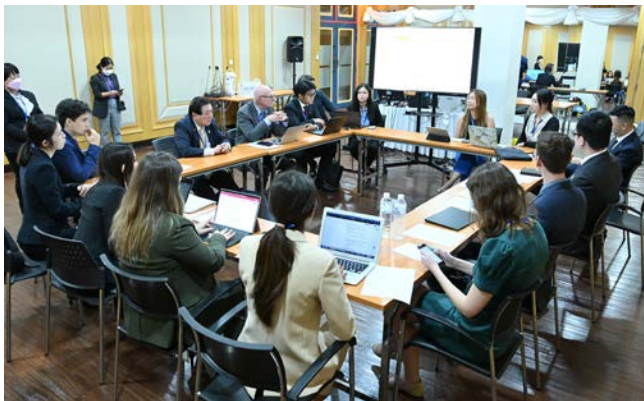
APEC Voices Youth Representatives discussing and drafting the APEC Voices 2022 Youth Declaration with the officials.