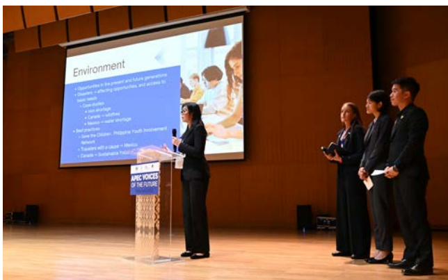
Group presentation on the Environmental Sustainability.