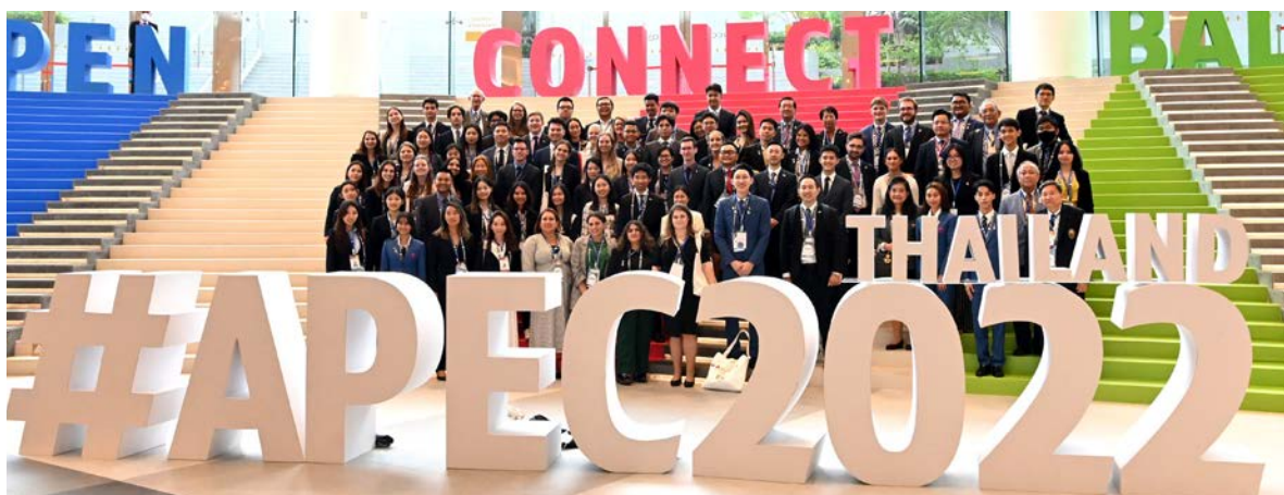
APEC Voices 2022 delegation at the BCG exhibition at Queen Sirikit National Convention Centre.

— Prayut Chan-o-cha, Prime Minister of Thailand