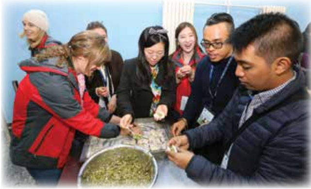
Being involved in the preparation of traditional food such as dumplings makes the visit more interesting and enriching for the delegates.