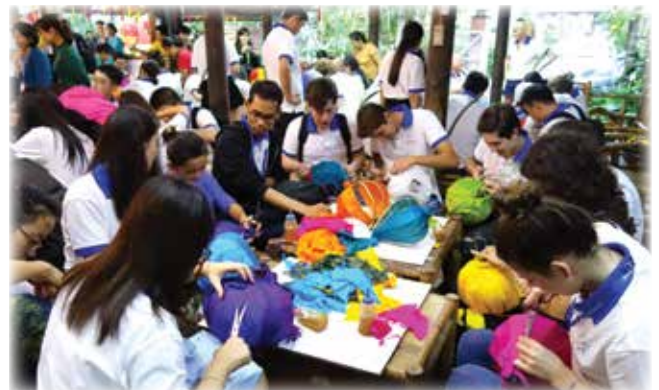
Youth delegates from Asia-Pacific testing their skills in creating their own lanterns in Hoi An, Viet Nam.