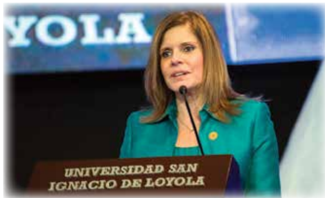
H.E. Dr Mercedes Araoz Fernandez, Vice-President of the Republic of Peru gracing the Opening Ceremony of the APEC Voices at the Universidad San Ignacio De Loyola in Lima, Peru.

“One day, in the not-too-distant future, your generation will be called upon to take up the mantle of promoting a stronger regional economy among APEC member nations. I encourage you to get to know your fellow Voices of the Future delegates. Together, you will be responsible for shaping the future of our global economy.”