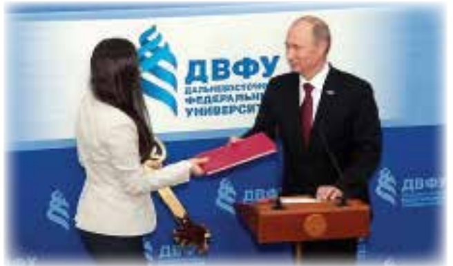
APEC Voices Representative from Russia presenting the APEC Voices Youth Declaration to H.E. Vladimir Putin, President of Russia in Vladivostok, Russia during the APEC Summit, 2012.

“You are the heirs to both the legacy and consequences of our present actions; your opinion matters as much as ours. I encourage you to tell us all of your concerns, your dreams, and the kind of global community you envision, so that together, we can shape a world that we can proudly bequeath to coming generations.”