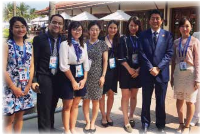
APEC Voices delegates from Japan with H.E. Shinzo Abe, Prime Minister of Japan.