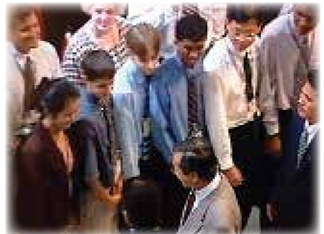
H.E. Tun Dr Mahathir Mohamad, Prime Minister of Malaysia, interacting with APEC Voices Delegates in Kuala Lumpur, Malaysia.