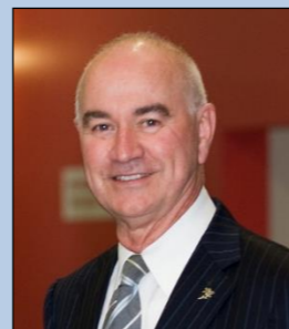
The Honourable Gary Nairn AO Chairman, The Duke of Edinburgh's International Award - Australia

Finally, I would like to acknowledge the work of the National Award Office, our Award Operating Authorities in each State and Territory, our 1,200 Award Centres, tens of thousands of volunteers, our donors and supporters for ensuring that our young people are ready for change, ready for our new normal, ready for our 'new world' .