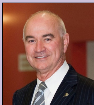
The Honourable Gary Nairn AO Chairman, The Duke of Edinburgh’s International Award - Australia

In the next financial year, we look forward to continuing to celebrate the Award in Australia’s 60 th Anniversary with His Royal Highness The Prince Edward, Earl of Wessex KG GCMG Chair of The Board of Trustees of The Duke of Edinburgh’s International Award Foundation. HRH, The Earl of Wessex will be joining us to thank our current delivery partners, donors and volunteers and grow the Awards reach and impact.”